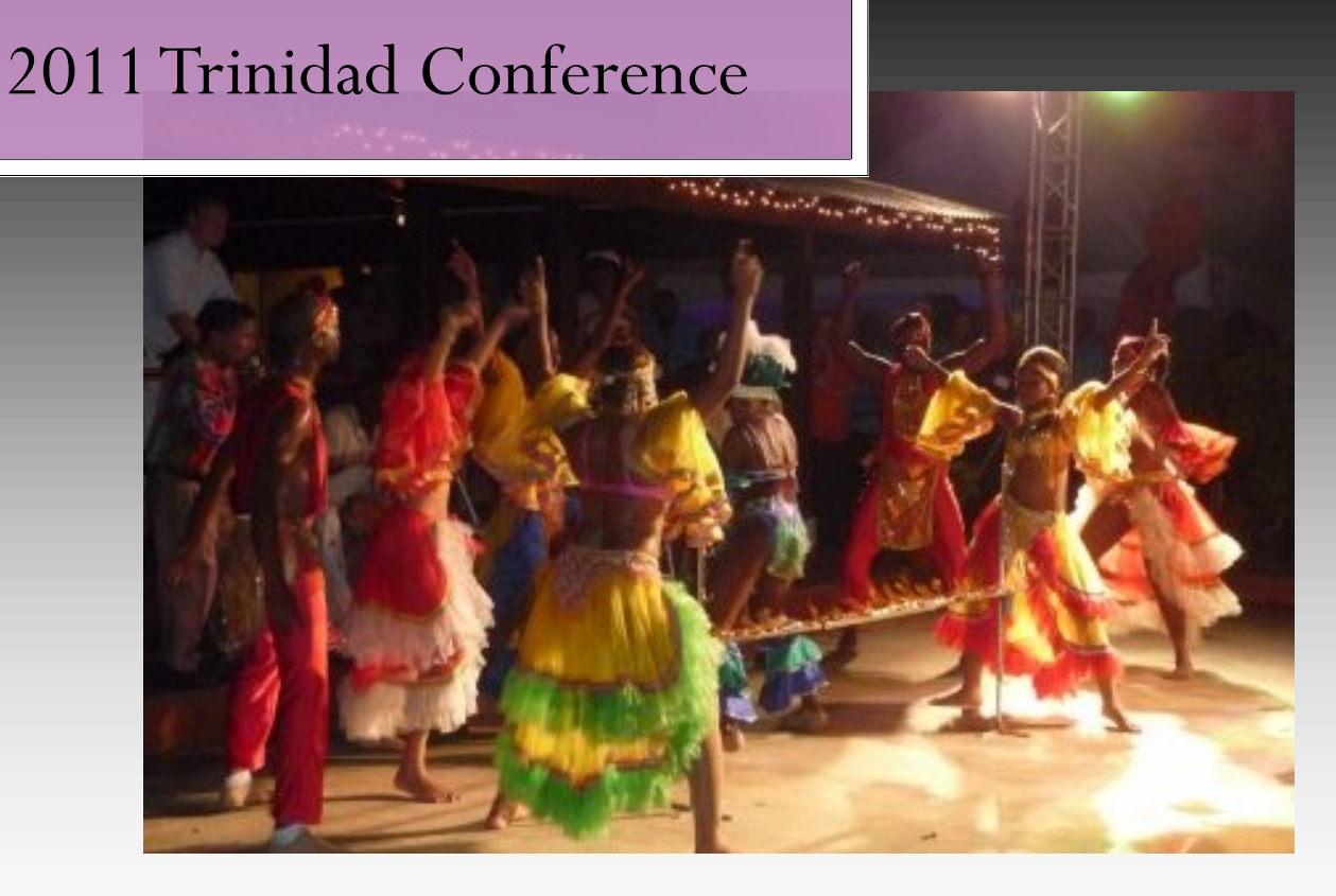
Festival Celebration at the Trinidad Gala